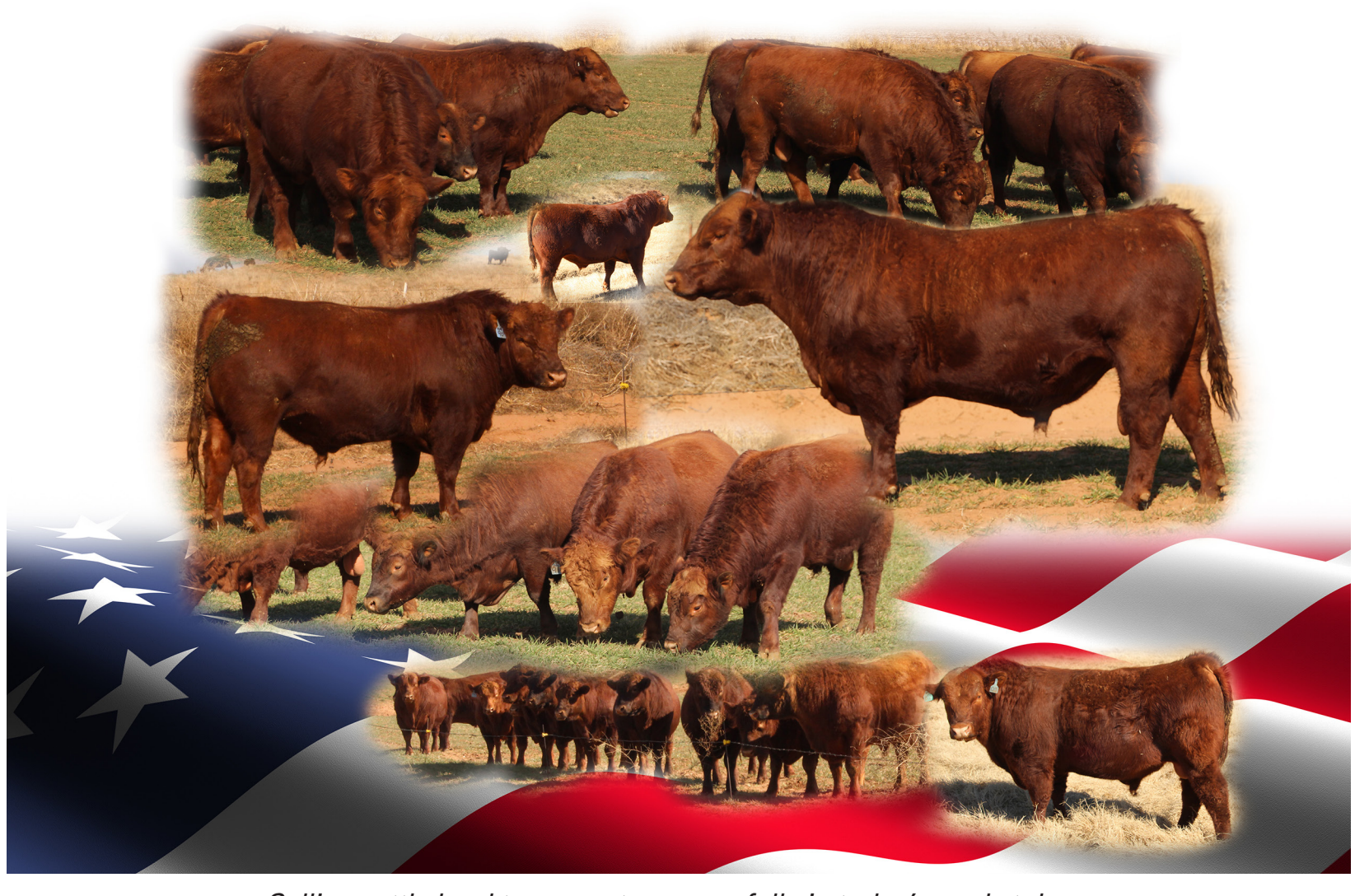
Selling cattle bred to compete successfully in today's marketplace.