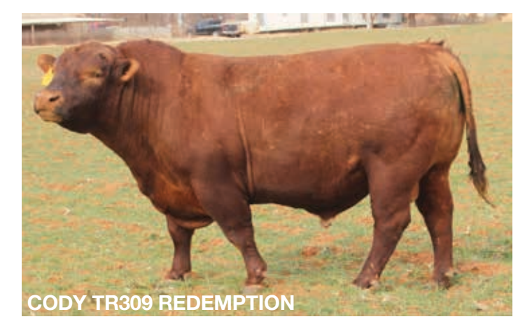
Lot 65 • Sired by CODY TR 309 REDEMPTION #3506755 & out of a 2015 hf by Cherokee Canyon X791. BD 3-3-17 • BW 64

– consigned by Crawford Red Angus • 2017 Commercial Bulls by BROWN JYJ REDEMPTION Y1334 #1441805 -