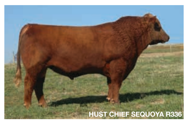
LOT 72 BD 3-4-17 BW 68 Frame Med

HUST CHIEF SEQUOYA R336 • RAAA #1025756 Category: 1A • Birth Date: 3/8 • Birth Wt. 76 • 100% AR